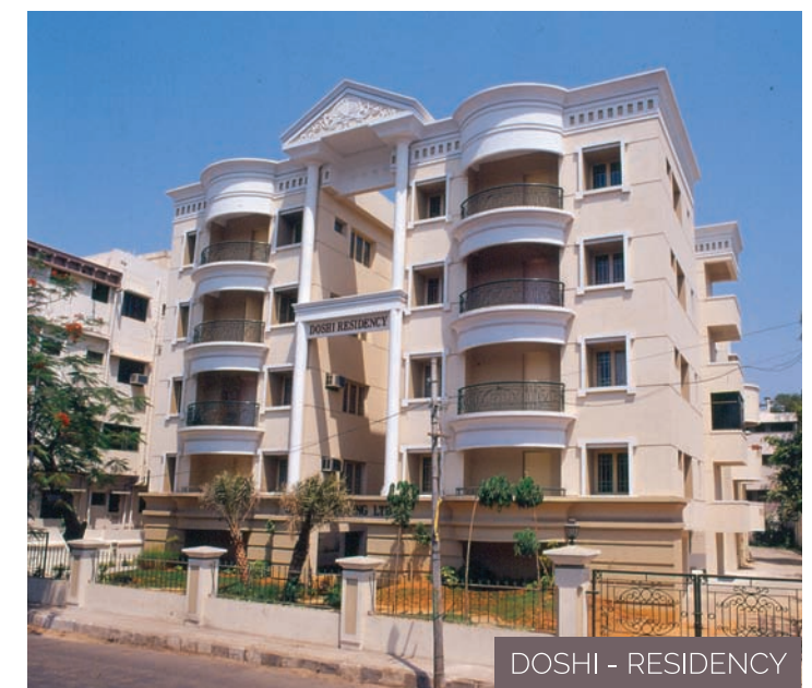
DOSHI - RESIDENCY