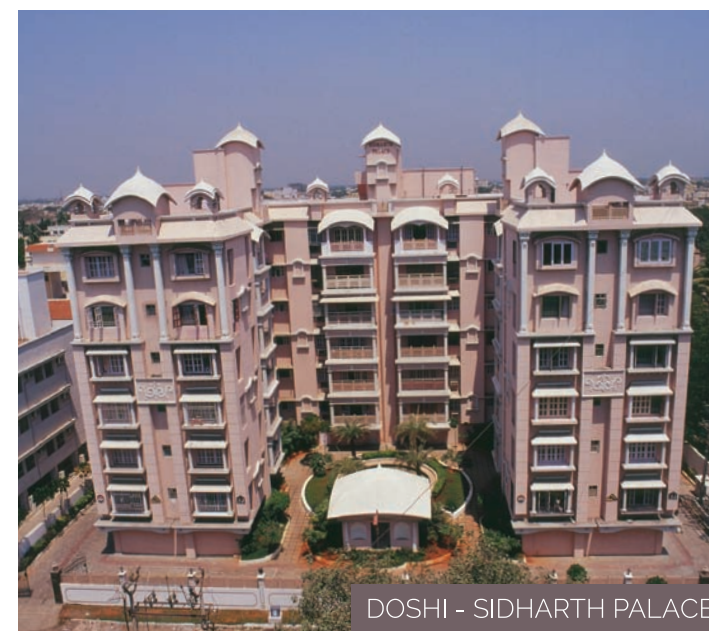
DOSHI - SIDHARTH PALACE