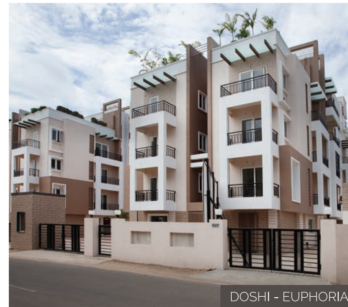
DOSHI - EUPHORIA