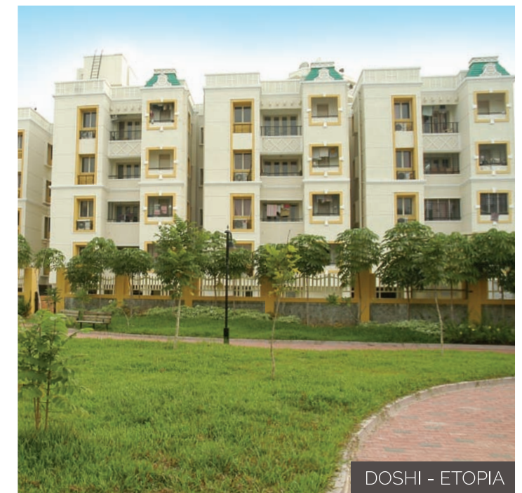
DOSHI - ETOPIA