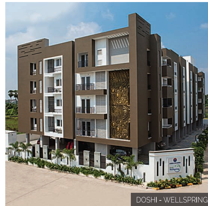
DOSHI - WELLSPRING