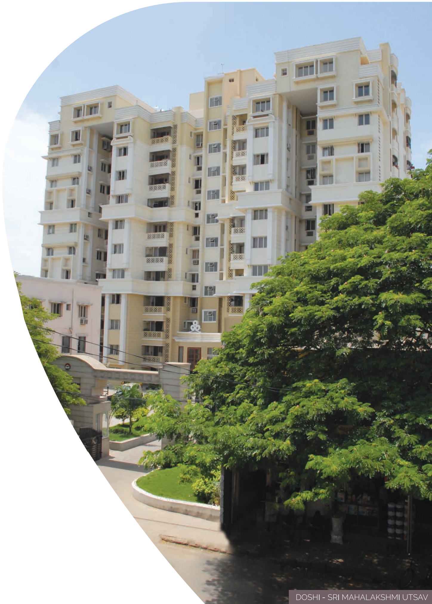
DOSHI - SRI MAHALAKSHMI UTSAV